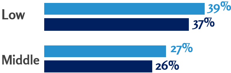
Enrollment by Income Level

CICV's private colleges and universities provide students with a more close-knit and personal environment than large public 4-year colleges and universities in Virginia.